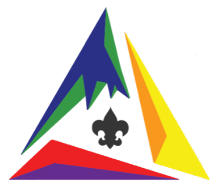
NATIONAL LEADERSHIP SEMINAR

Last week, the Southern Region hosted NLS at YMCA Camp Widjiwagan in Antioch, Tennessee. NLS, or National Leadership Seminar, is a weekend event for arrowmen who lead, or want to lead, in their lodge or chapter. Coosa Lodge had a group of about 20 go to this year's NLS. Throughout the weekend, participants learned about the different types of learning styles, hear real life leadership stories, learn about adaptive leadership, learn how to use the Leader's decision making process, and how to bring back everything they learned and implement it to help make their lodge a high preforming lodge. This training is great, not just for the leadership of a lodge and chapters, but for anyone who would like to hold a position in the OA in the future. The materials