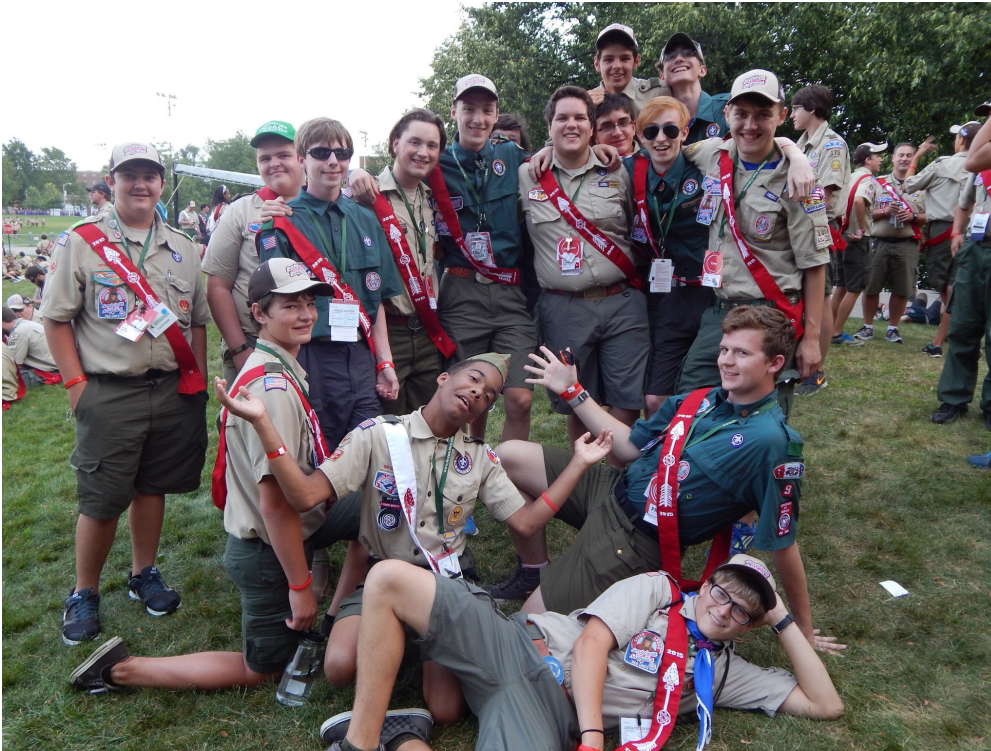
Coosa Lodge arrowmen at NOAC 2015